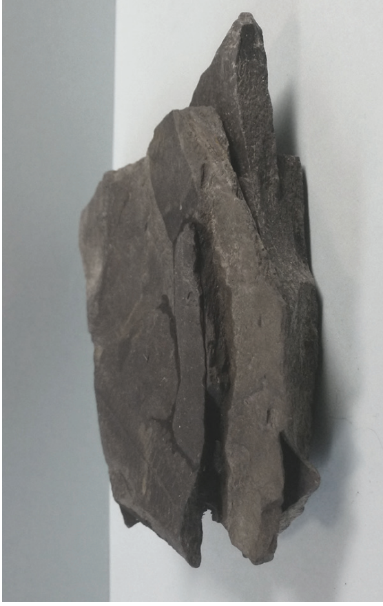
SHALE or SLATE