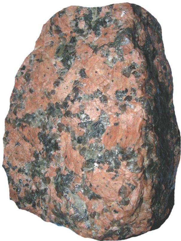
PINK GRANITE (lots of feldspar)